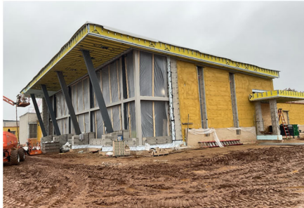
Temporary building enclosure

Work on our new high school continues both inside and outside. As winter quickly approaches, our construction team has planned temporary building enclosures, as they systematically finish the outside of the building envelope. This is important because it protects the work done inside and allows the spaces to be temporarily