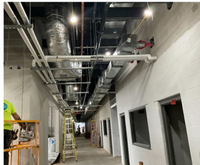
Inside the mechanical mezzanines

Inside, the mechanical mezzanines have been completed. A mechanical mezzanine is the space between the floor and ceiling that house the ducts and pipes that are part of the school's building systems, controlling the climate. It will later be covered with a drop ceiling for easy access.